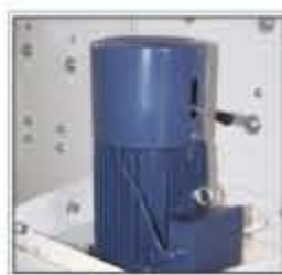
带刹车装置的驱动电机 Drive motor with brake