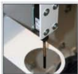
筛体振动监测器 The screen body vibration monitor